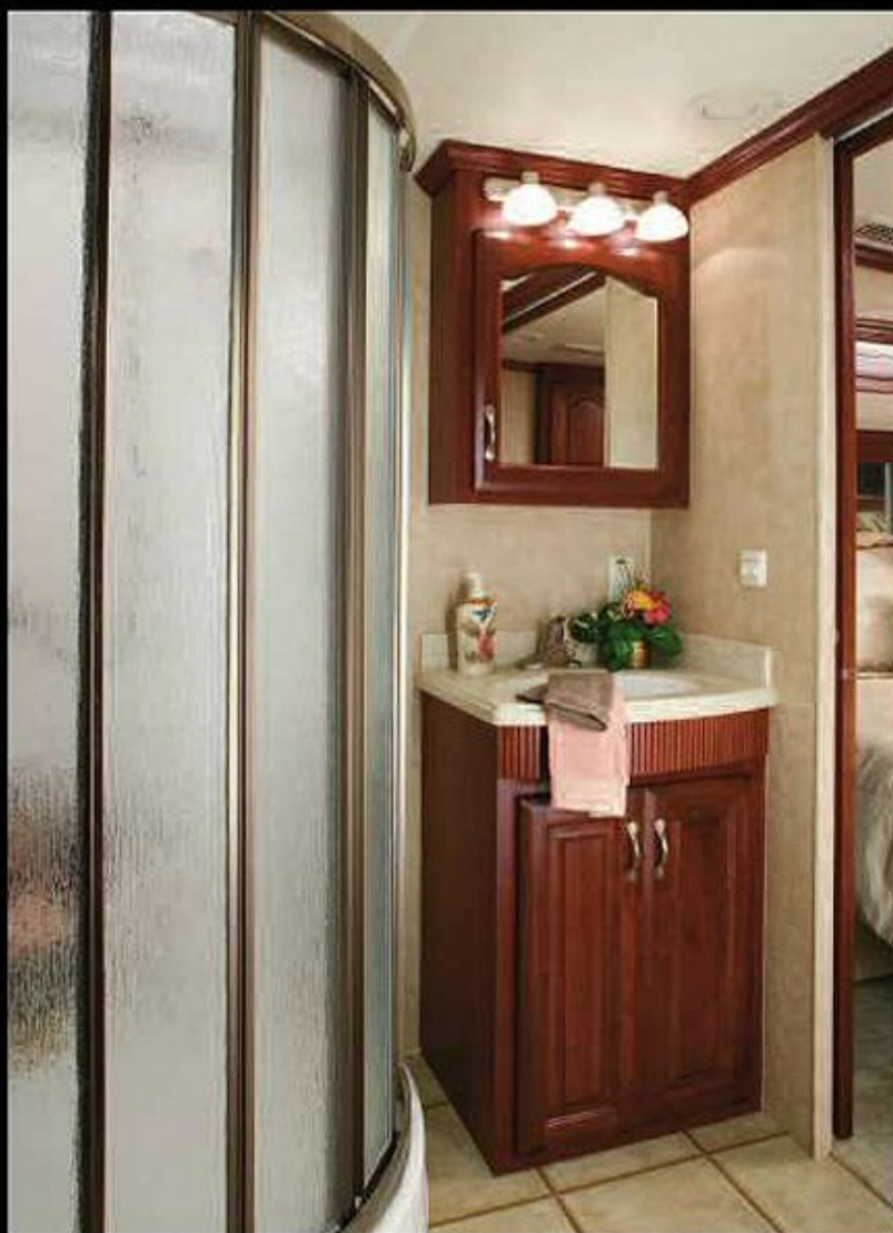
▲ LARGE CORNER SHOWER WITH SLIDING GLASS DOOR IS A STANDARD BATHROOM FEATURE.