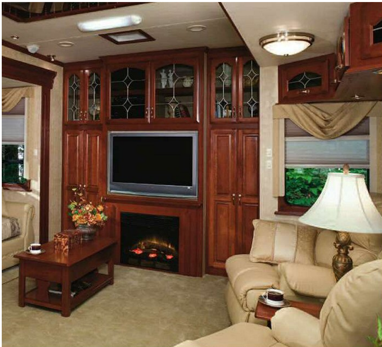
▲ 37 REB FLOOR PLAN SHOWN WITH CASHMERE DECOR, CHERRY CABINETRY AND OPTIONAL 40" LCD TV

TRAVEL THE HIGH ROAD OF FINE RV LIVING WITH ESCALADE. THESE LUXURY FIFTH WHEELS ARE DESIGNED WITH A UNIQUE BLEND OF PRACTICALITY AND ELEGANCE, RESULTING IN THE MOST BEAUTIFULLY LIVABLE TRAVEL HOME YOU'LL EVER FIND. FROM LAVISH LIVING AREAS TO WELL APPOINTED KITCHENS, THE ESCALADE CREATES THE KIND OF RV LIFE YOU DESERVE.