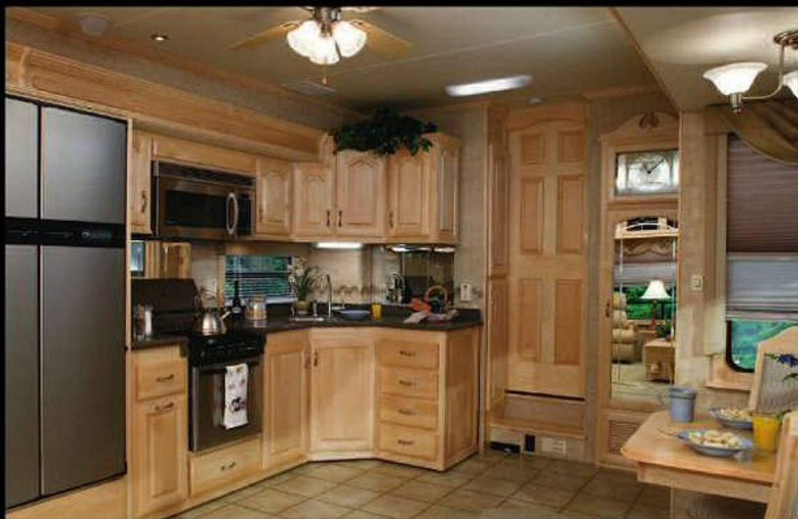
▲ 37 KSB FLOOR PLAN SHOWN WITH CASHMERE DECOR AND MAPLE CABINETRY