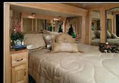
▲ 36 KSB FLOOR PLAN SHOWN WITH CASHMERE DECOR AND MAPLE CABINETS