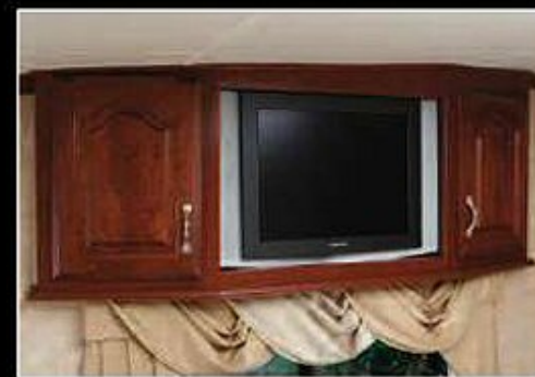
▲ HANDSOME OVERHEAD BEDROOM CABINET HOLDS A 20" LCD TV.